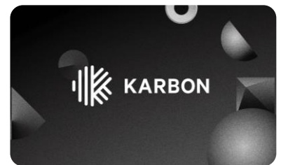
Read: Karbon x RyeStrategy