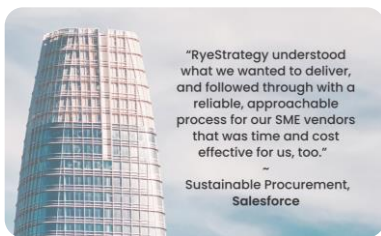
Read: Salesforce x RyeStrategy

Having worked directly with numerous small to medium-sized businesses, and as a small business ourselves, we know the ins and outs of decarbonization at the SMB scale, and are here to support you every step of the way. As the supplier engagement partner to some of the world's largest climate-forward enterprises, we further understand the sustainability needs and demands of your most important customers, and are ready to work with you on each unique requirement, goal, and outcome expected of your organization. We're here to make the decarbonization process as affordable, worry-free, and impactful as possible.